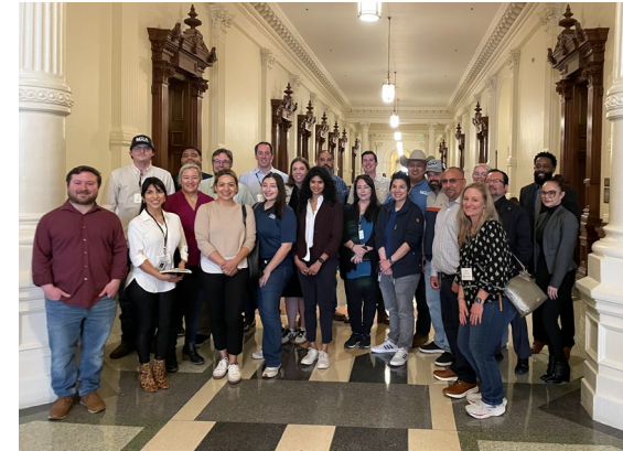
Texas Public Power Corridor Leadership Academy Capitol Visit