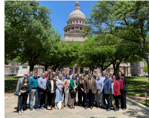
Emerging Leaders Cohort and EDS Team Capitol Visit

The team participated in numerous stakeholder groups to provide direct feedback and input to legislation as it went through the process.