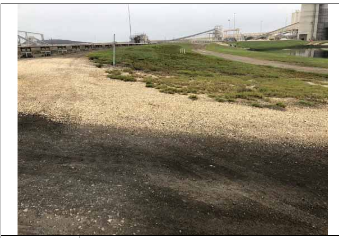
Photograph: 20 North Bottom Ash Pond – standing on northwest corner – facing southwest. Photo taken 12/14/2021.