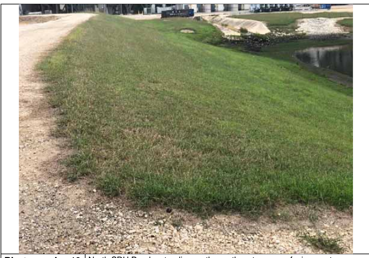
Photograph: 40 North SRH Pond – standing on the northeast corner – facing west. Photo taken 12/14/2021.