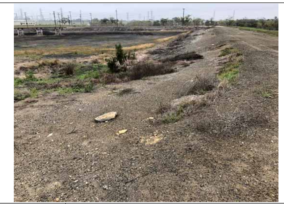
Photograph: 23 North Bottom Ash Pond – standing on southeast corner – facing north. Photo taken 12/14/2021.