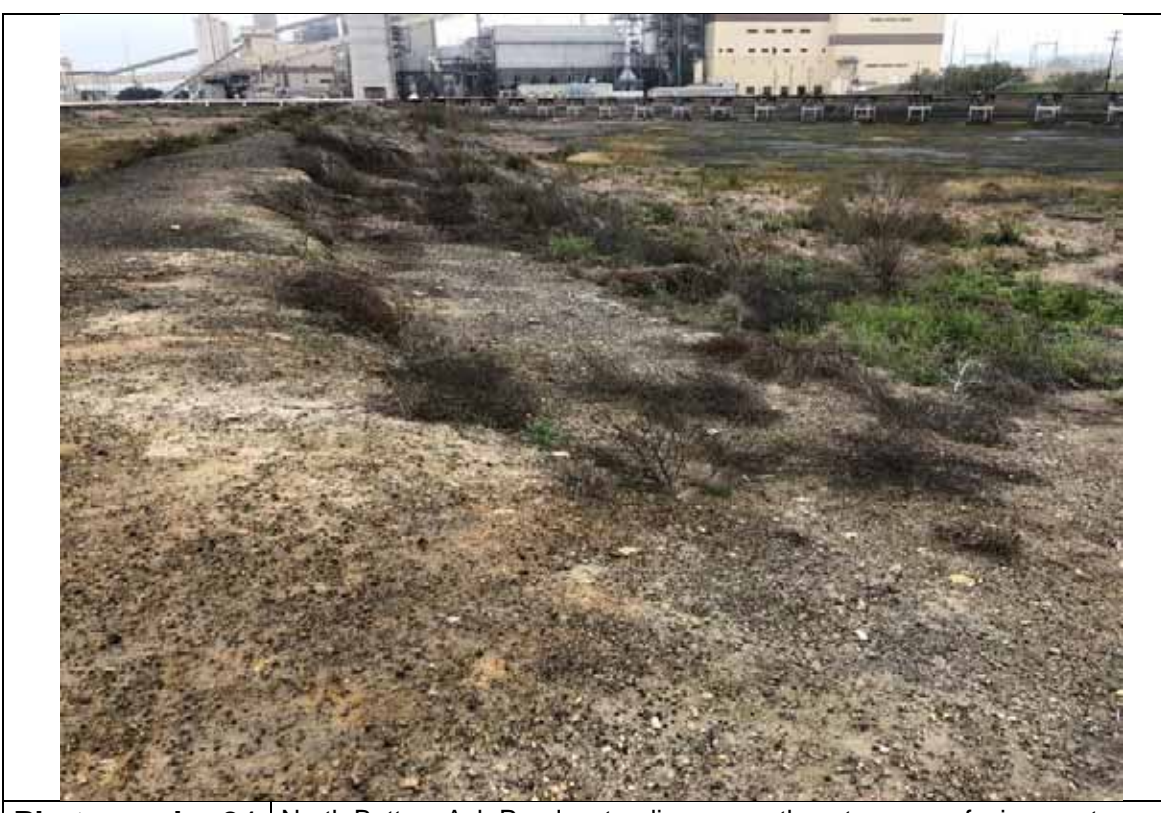
Photograph: 24 North Bottom Ash Pond – standing on southeast corner – facing west. Photo taken 12/14/2021.