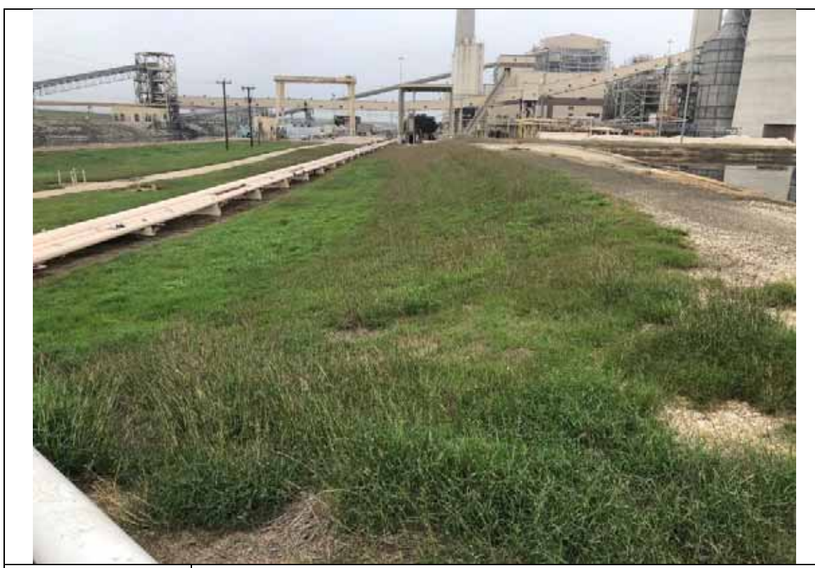
Photograph: 33 South SRH Pond – standing on the southeast corner – facing west. Photo taken 12/14/2021.