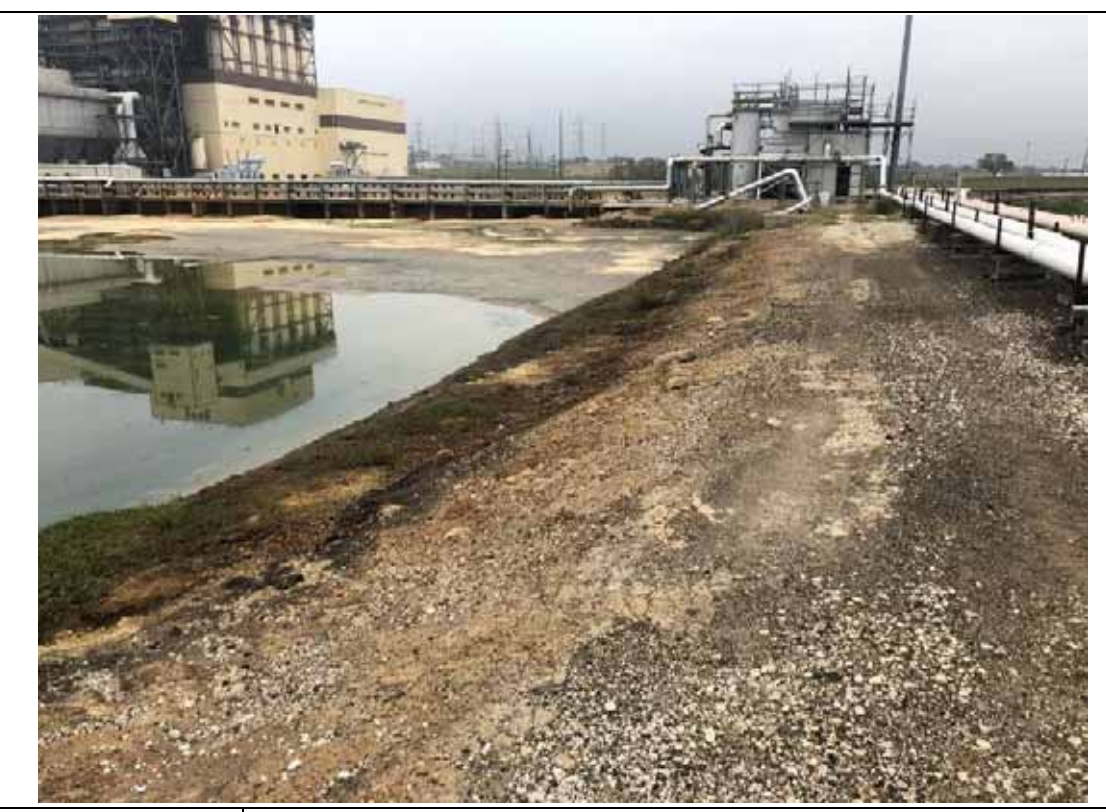
Photograph: 35 South SRH Pond – standing on the southeast corner – facing north. Photo taken 12/14/2021.