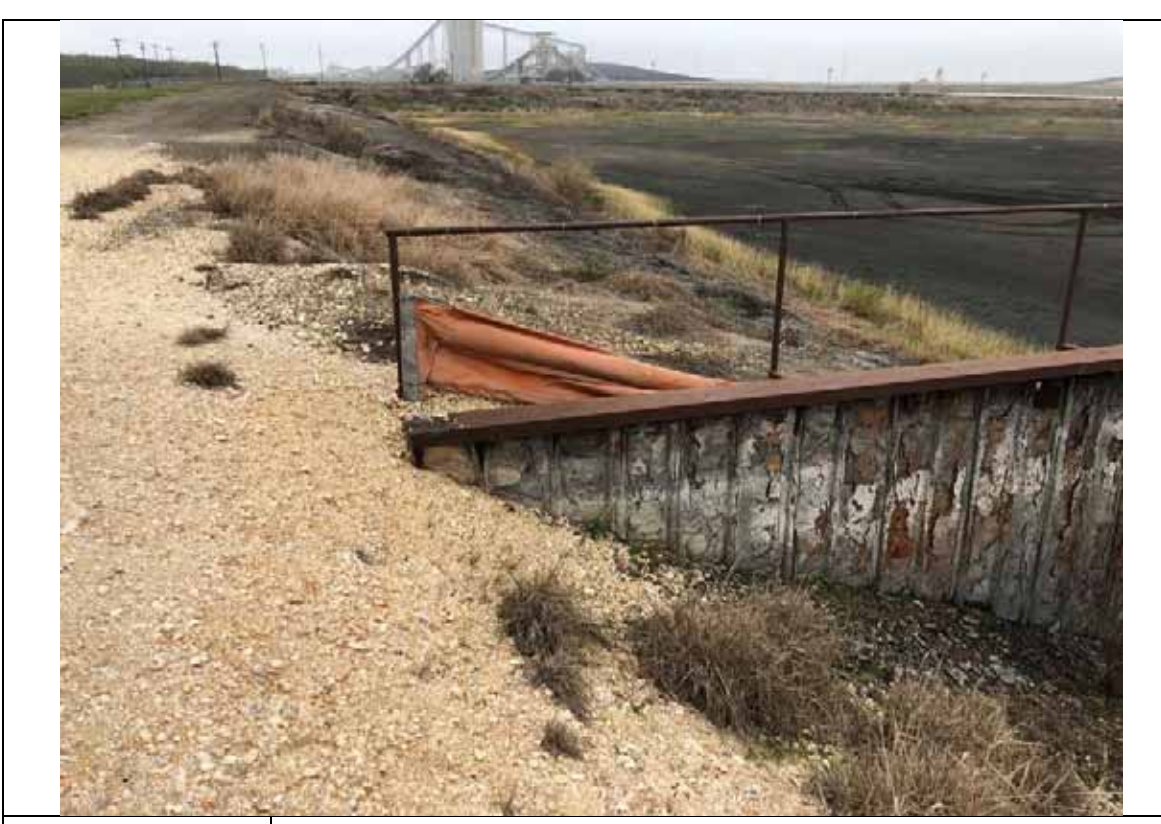
Photograph: 22 North Bottom Ash Pond – standing on northeast corner – facing south. Photo taken 12/14/2021.