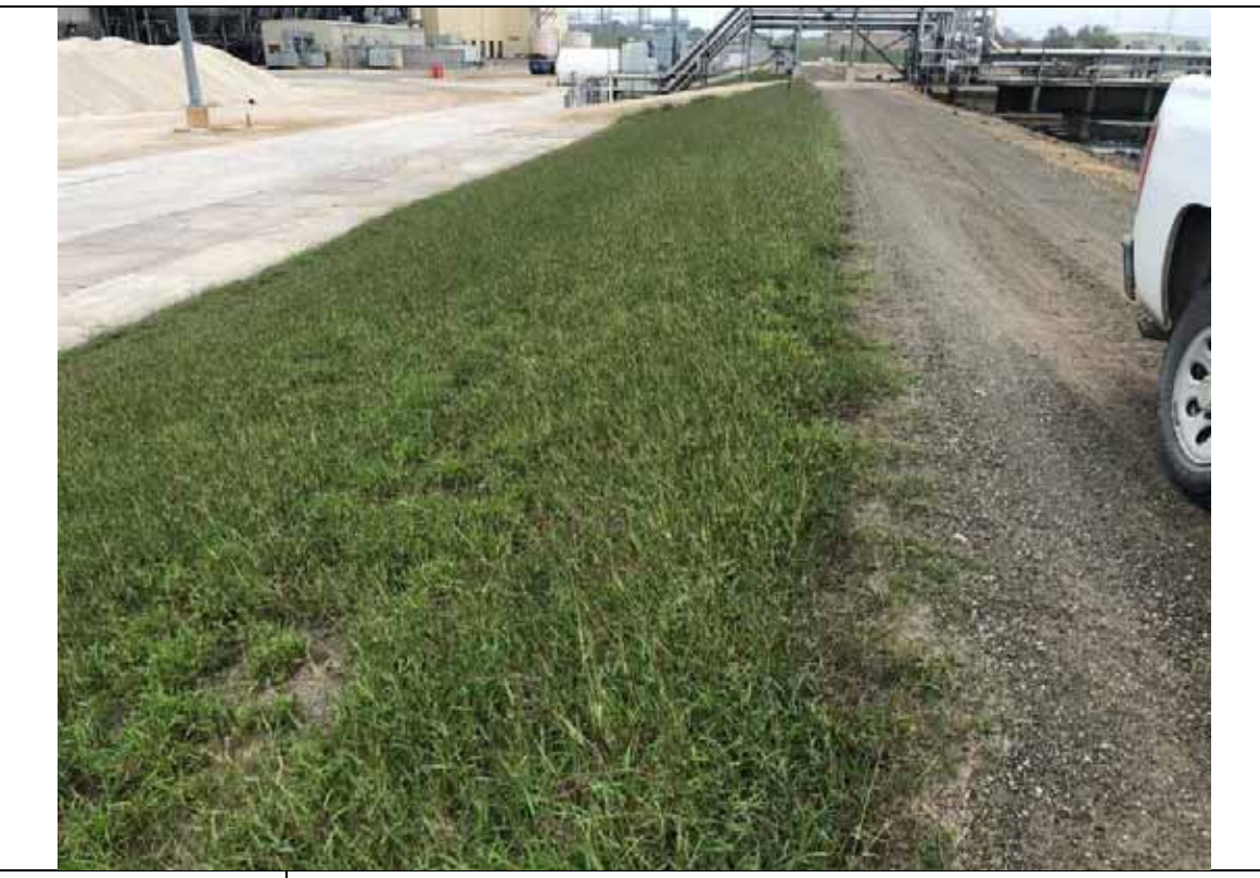
Photograph: 42 South SRH Pond – standing on the southwest corner – facing north. Photo taken 12/14/2021.