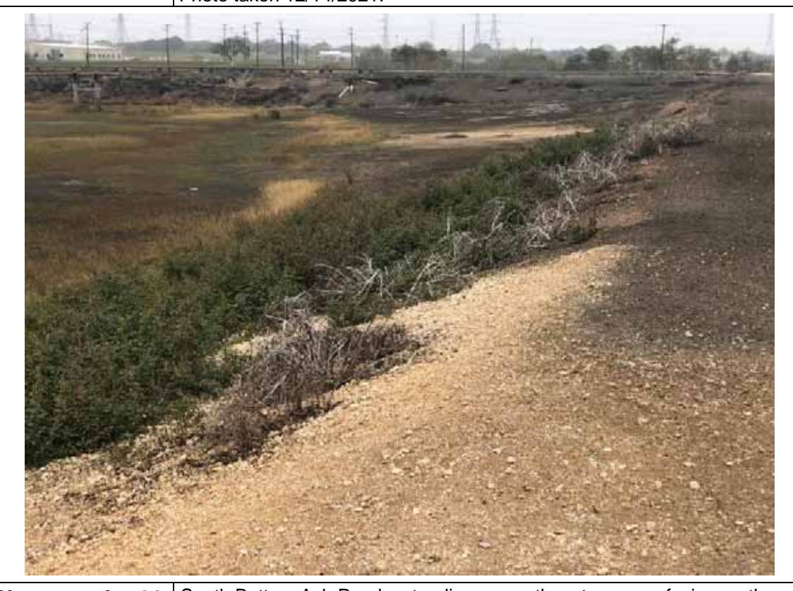
Photograph: 28 South Bottom Ash Pond – standing on southeast corner – facing north. Photo taken 12/14/2021.