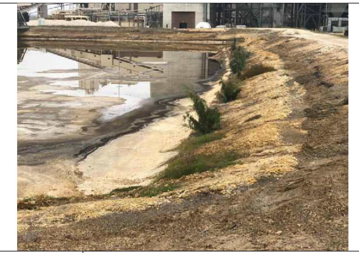
Photograph: 39 North SRH Pond – standing on the northeast corner – facing west. Photo taken 12/14/2021.