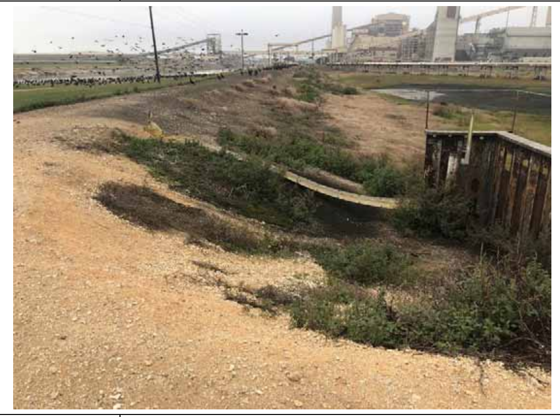
Photograph: 30 South Bottom Ash Pond – standing on southeast corner – facing west. Photo taken 12/14/2021.