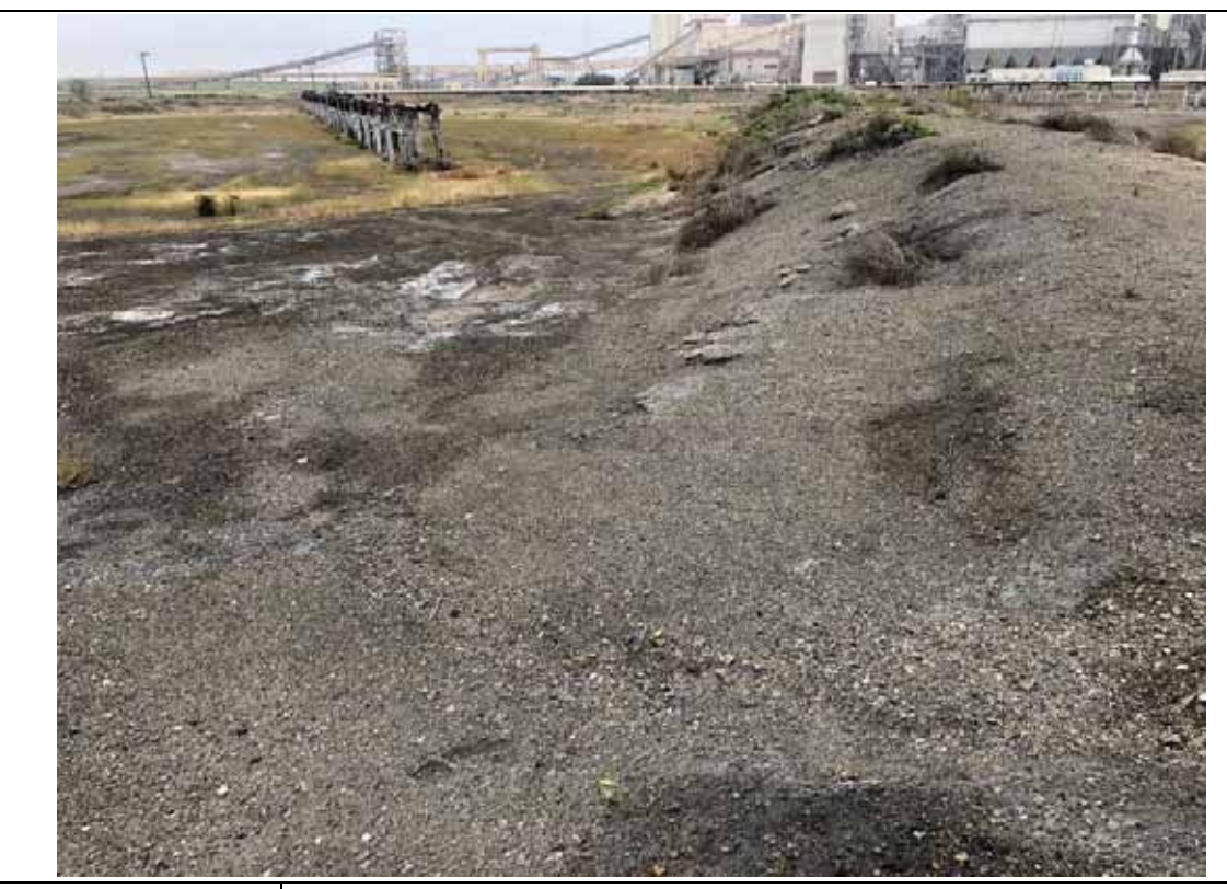
Photograph: 25 South Bottom Ash Pond – standing on northeast corner – facing west. Photo taken 12/14/2021.