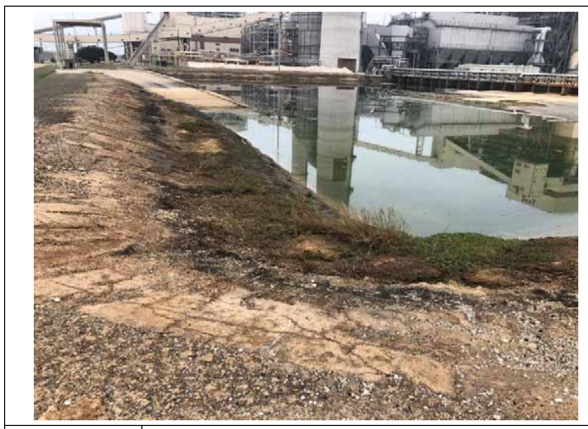
Photograph: 34 South SRH Pond – standing on the southeast corner – facing west. Photo taken 12/14/2021.