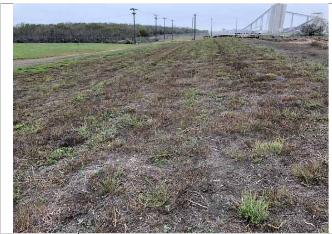
Photograph: 27 South Bottom Ash Pond – standing on northeast corner – facing south. Photo taken 12/14/2021.