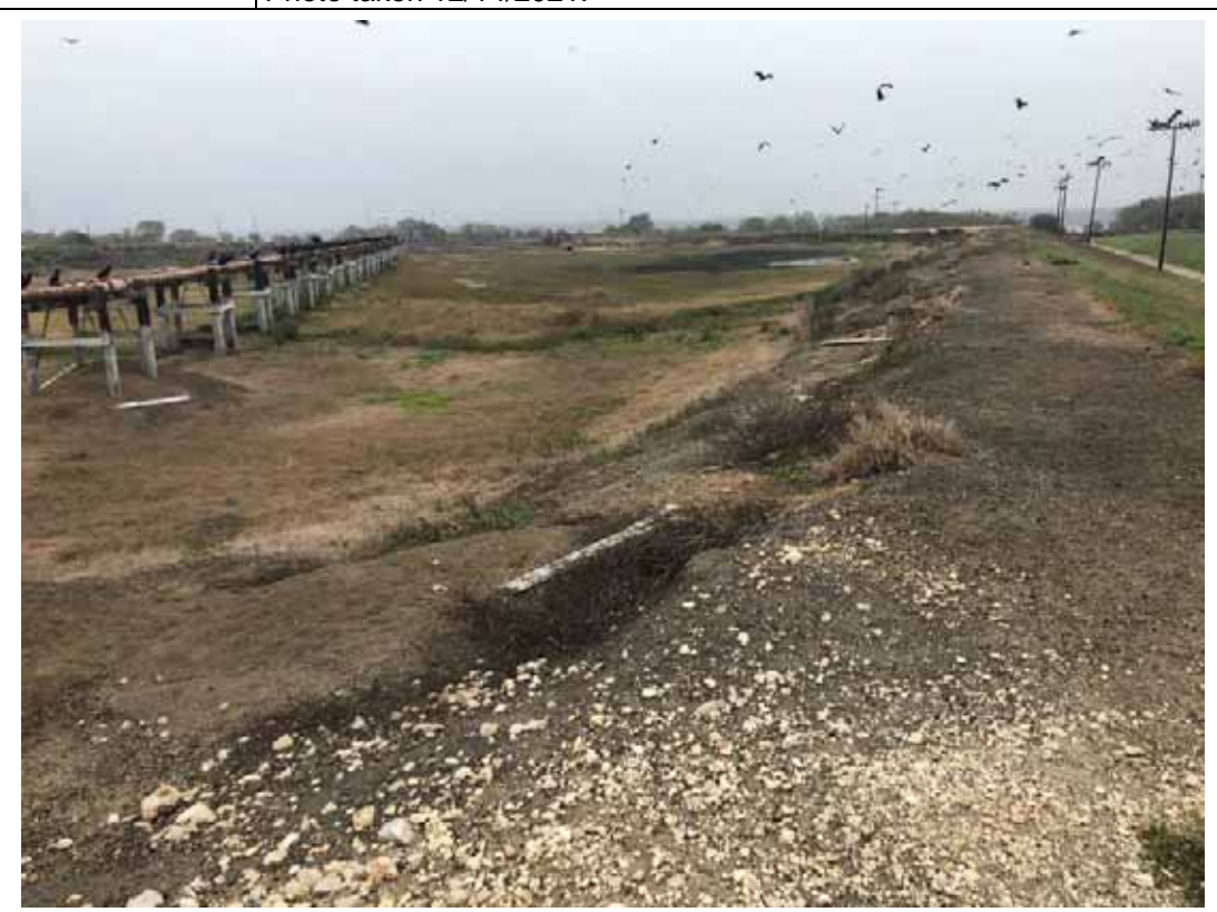
Photograph: 32 South Bottom Ash Pond – standing on southwest corner – facing east. Photo taken 12/14/2021.