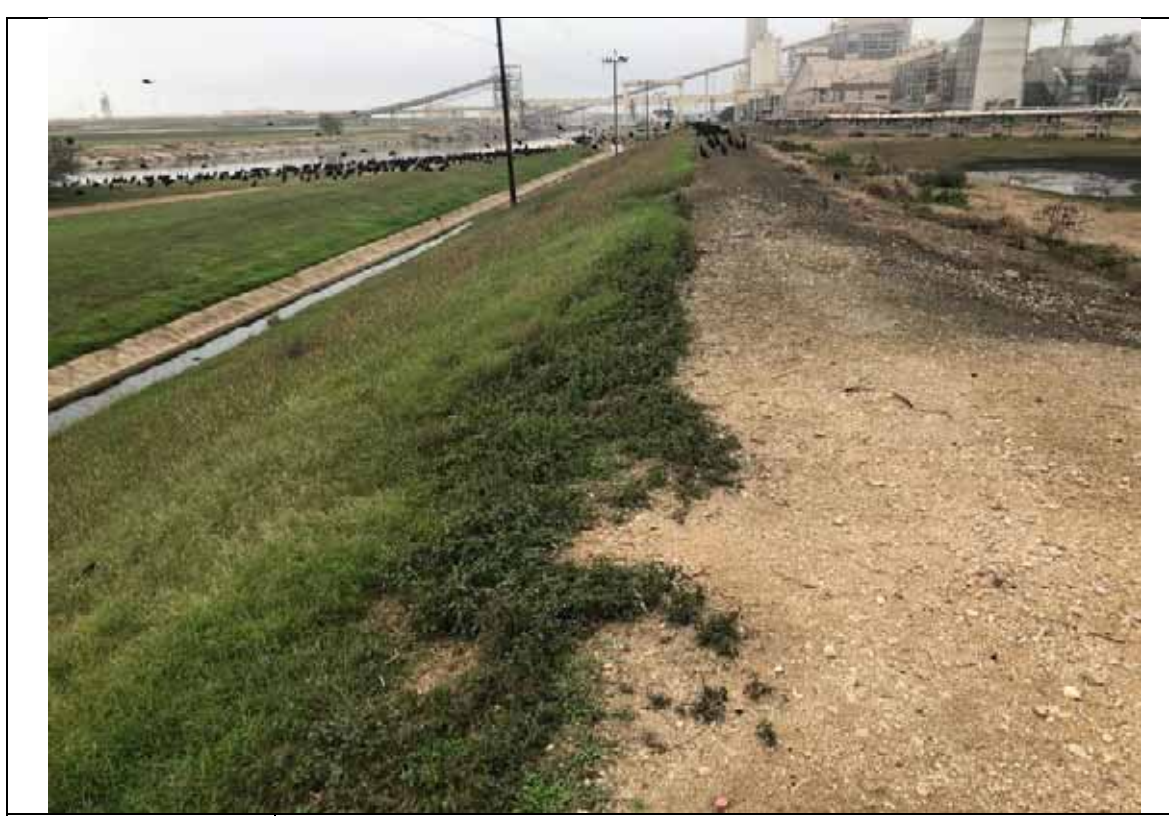
Photograph: 31 South Bottom Ash Pond – standing on southeast corner – facing west. Photo taken 12/14/2021.