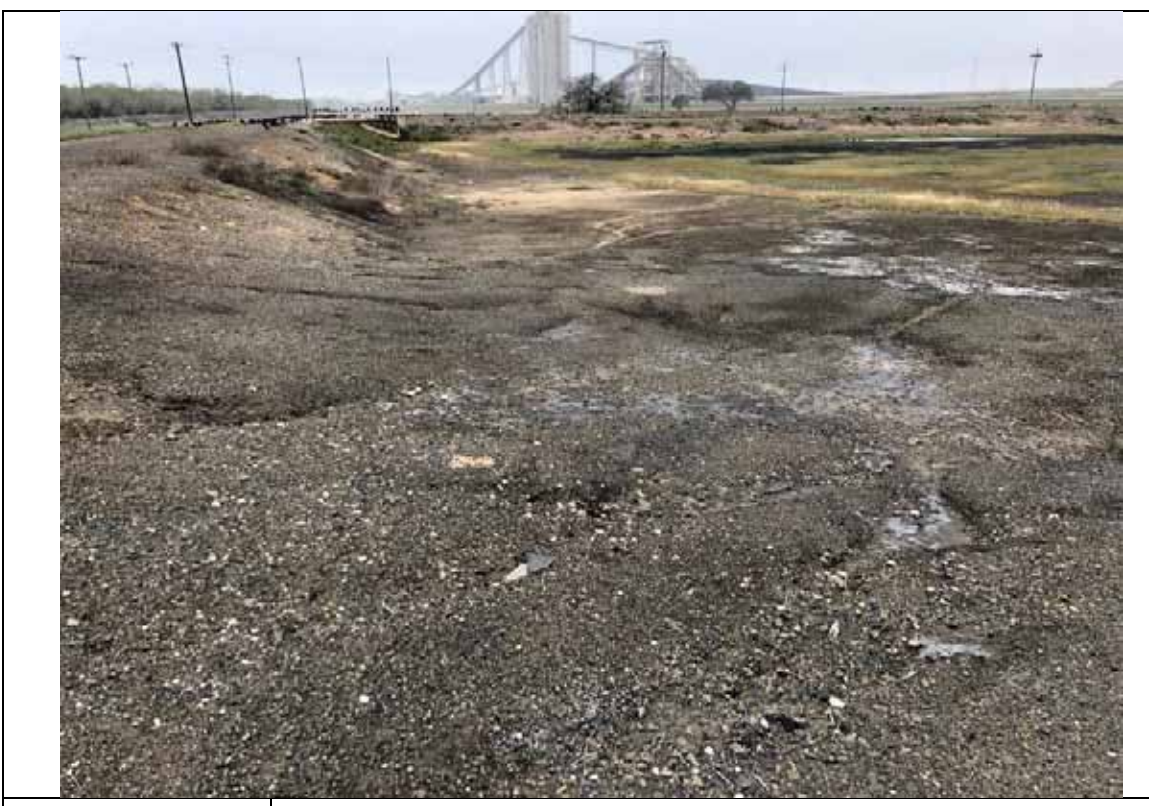
Photograph: 26 South Bottom Ash Pond – standing on northeast corner – facing south. Photo taken 12/14/2021.