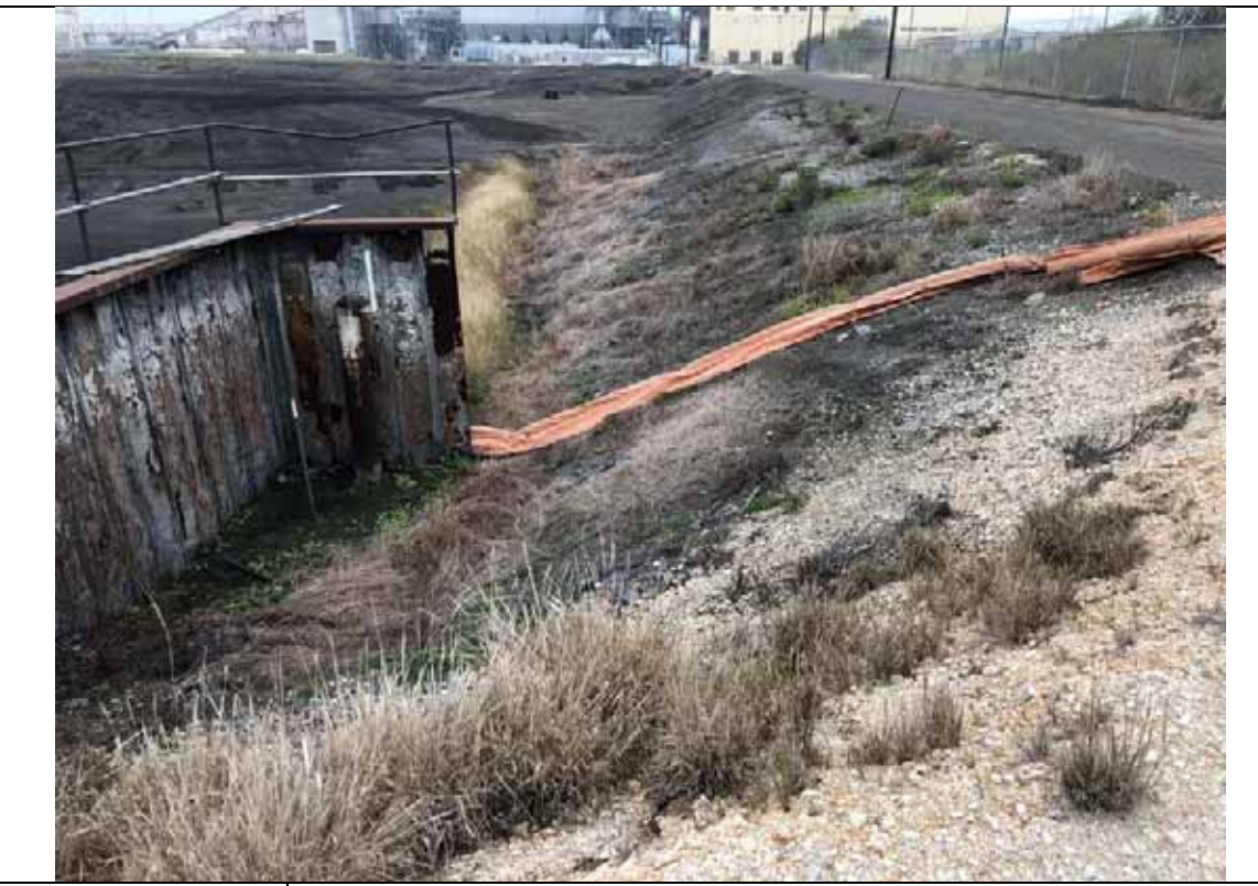
Photograph: 21 North Bottom Ash Pond – standing on northeast corner – facing west. Photo taken 12/14/2021.