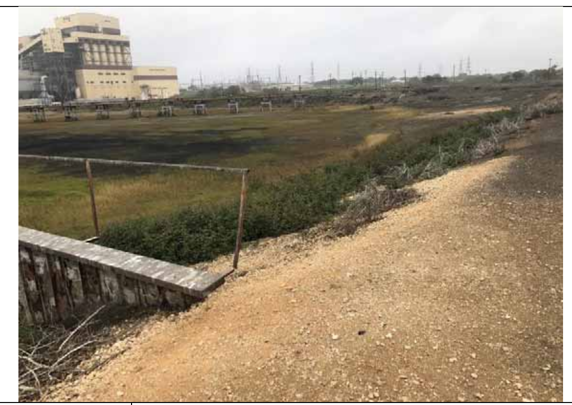
Photograph: 29 South Bottom Ash Pond – standing on southeast corner – facing northwest. Photo taken 12/14/2021.