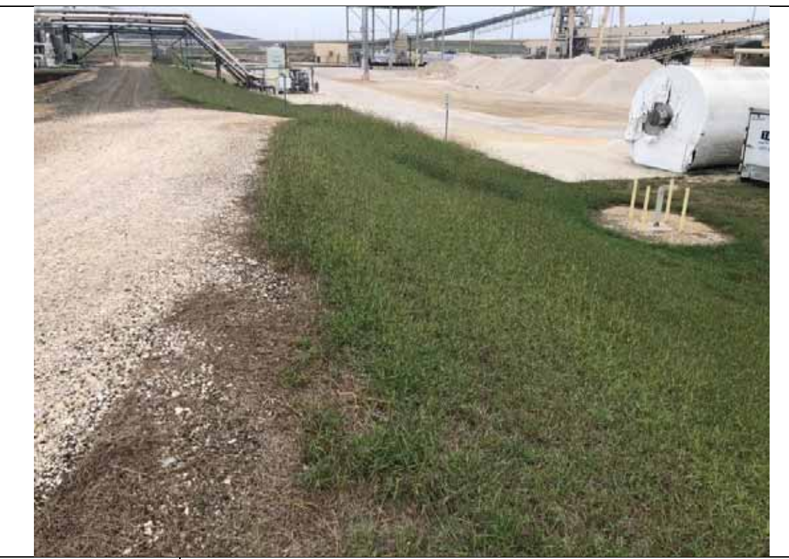
Photograph: 41 North SRH Pond – standing on the northwest corner – facing south. Photo taken 12/14/2021.