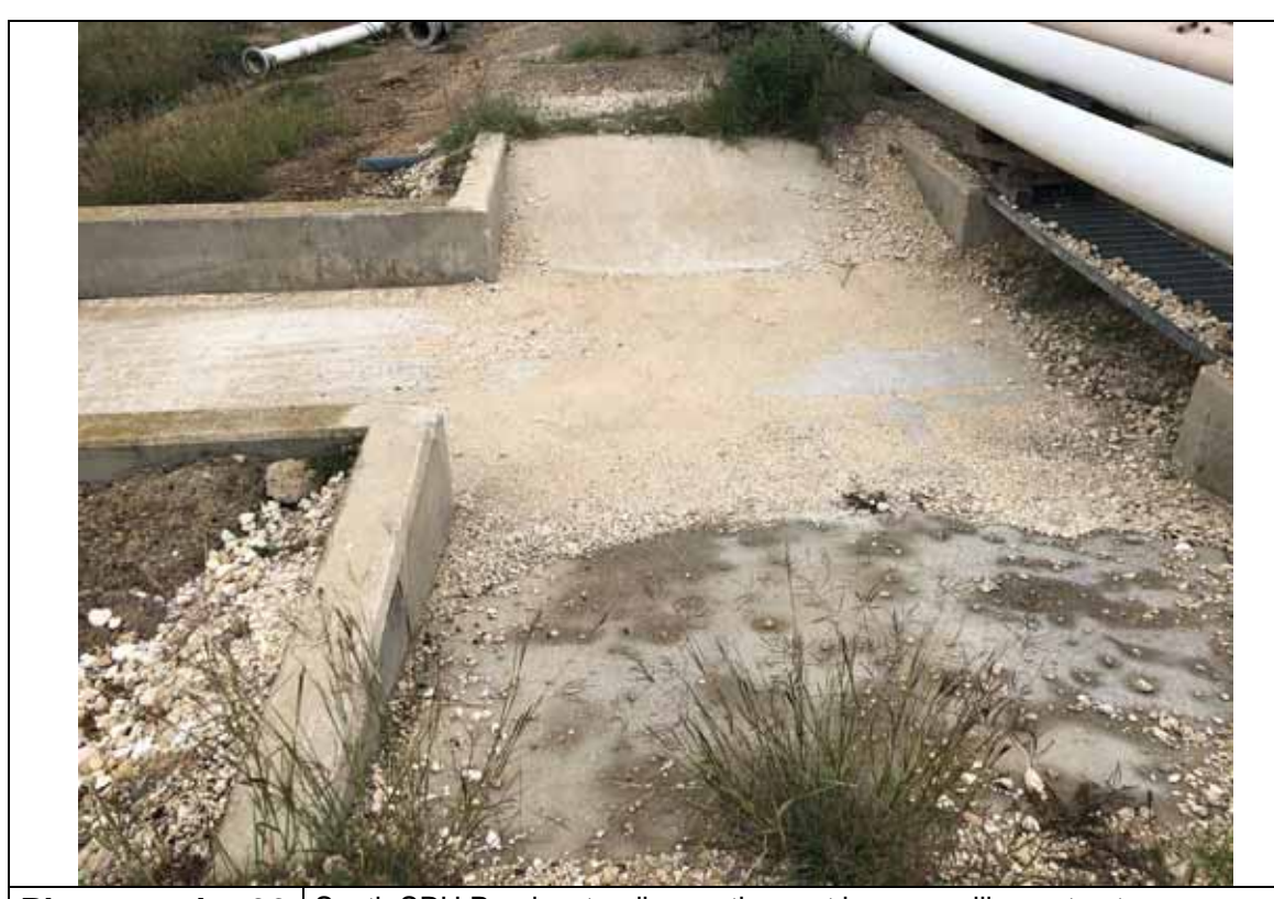
Photograph: 36 South SRH Pond – standing on the east berm – spillway structure. Photo taken 12/14/2021.