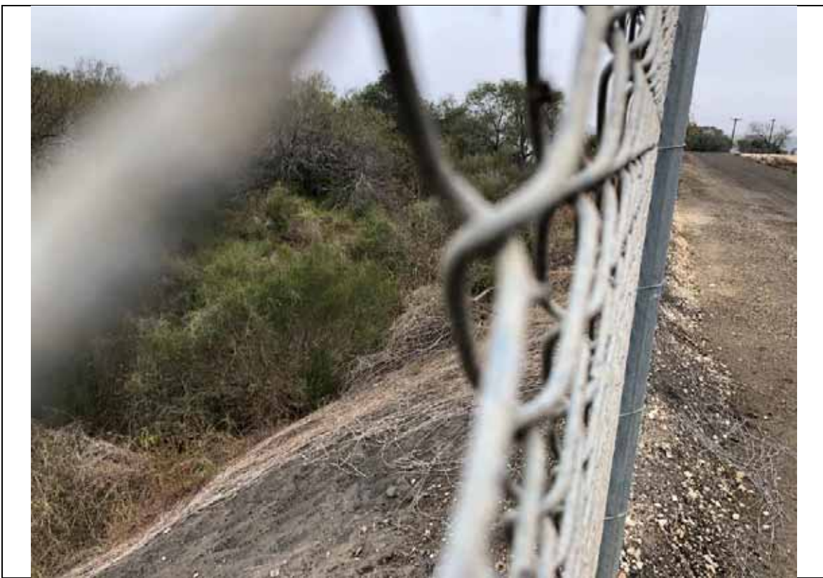
Photograph: 19 North Bottom Ash Pond – standing on northwest corner – facing east. Photo taken 12/14/2021.