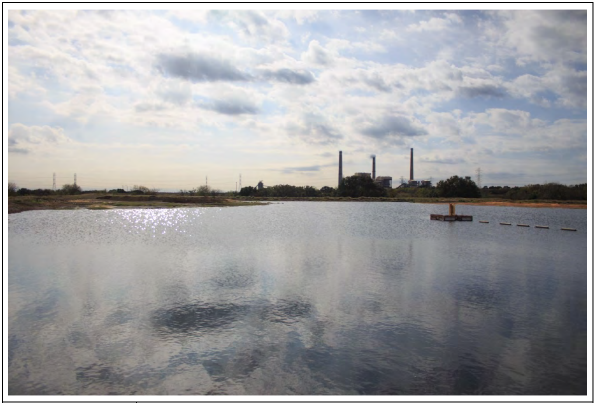
Photograph: 8 Evaporation Pond – standing on northern berm – facing south. Photo taken 12/16/15.