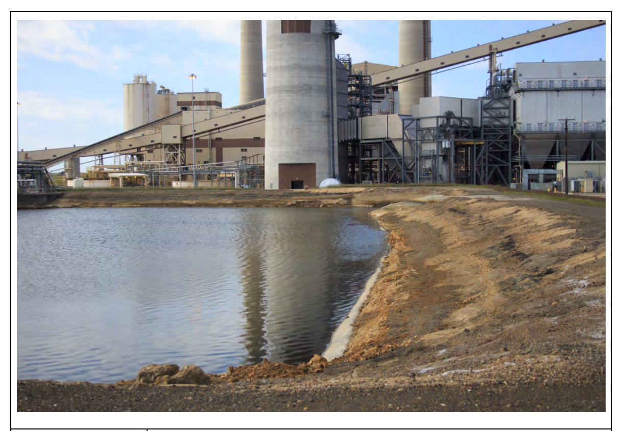
Photograph: 17 North SRH Pond – standing on northeast corner of pond – facing west. Photo taken 12/16/15.