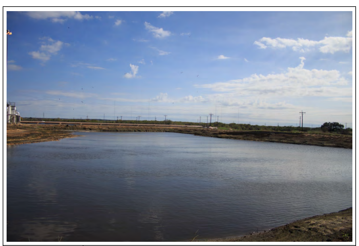
Photograph: 22 South SRH Pond – standing on western berm – facing southeast. Photo taken 12/16/15.