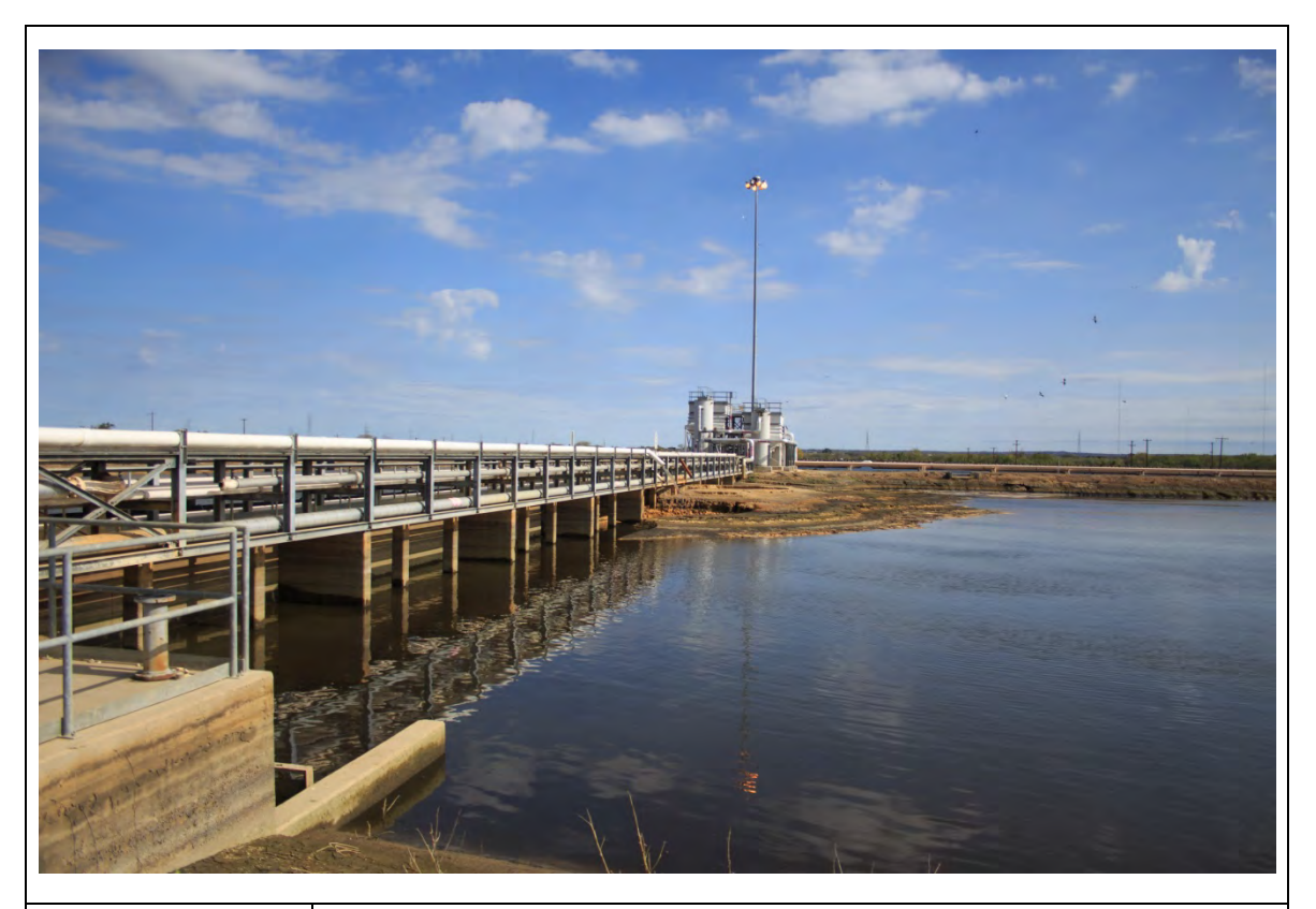
Photograph: 21 South SRH Pond – standing on western berm – facing east. Photo taken 12/16/15.