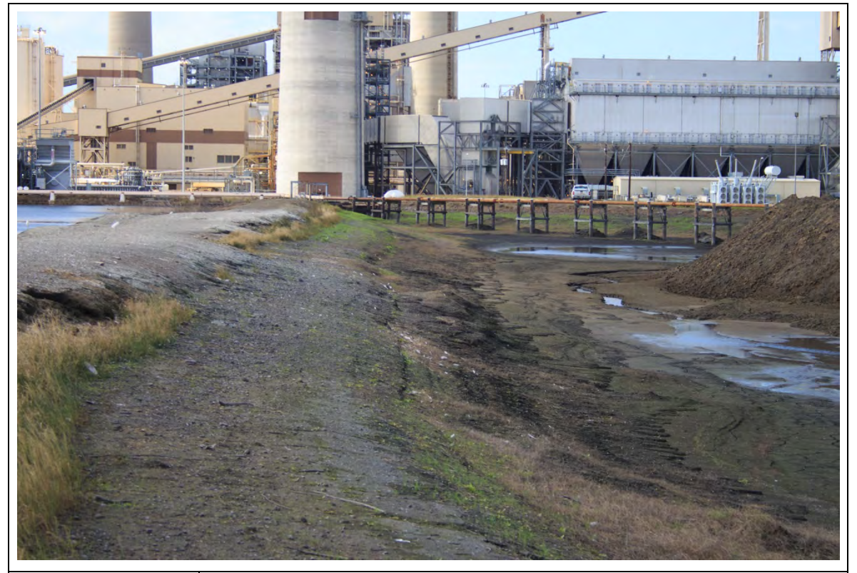
Photograph: 16 North Bottom Ash Pond – standing on southern berm – facing west. Photo taken 12/16/15.