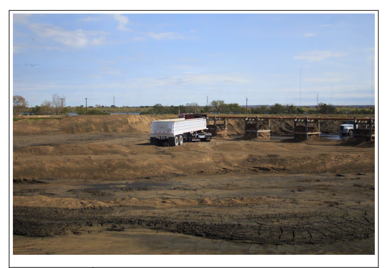
Photograph: 11 North Bottom Ash Pond – standing on western berm – facing northeast. Pond was drained to remove residuals. Photo taken 12/16/15.