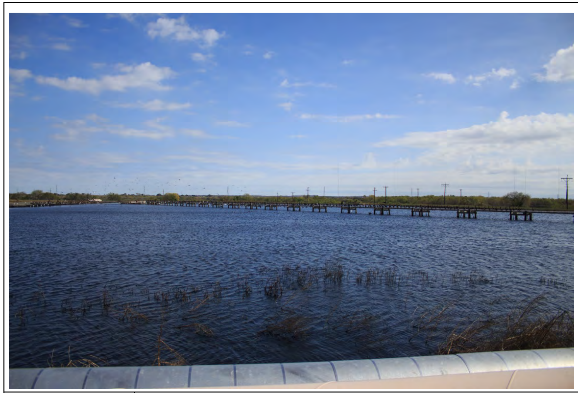
Photograph: 26 South Bottom Ash Pond – standing on western berm – facing east. Photo taken 12/16/15.