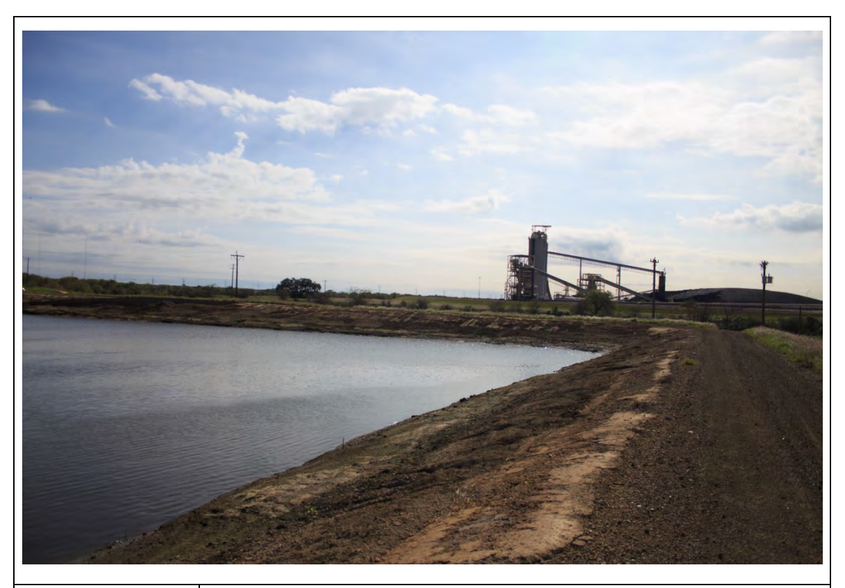
Photograph: 23 South SRH Pond – standing on western berm – facing south. Photo taken 12/16/15.