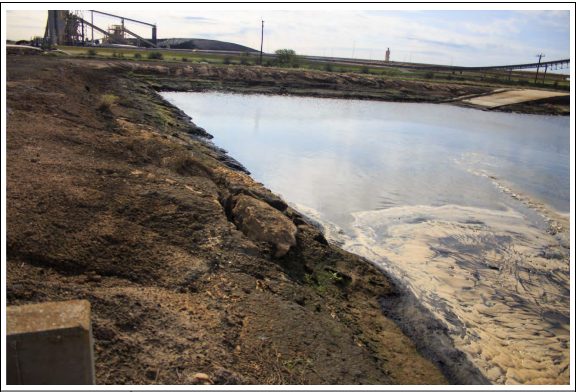
Photograph: 24 South SRH Pond – standing on eastern berm – facing south. Erosional features on eastern berm. Photo taken 12/16/15.