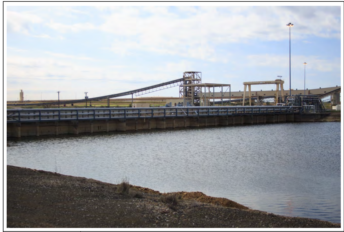
Photograph: 18 North SRH Pond – standing on eastern berm – facing southwest. Photo taken 12/16/15.