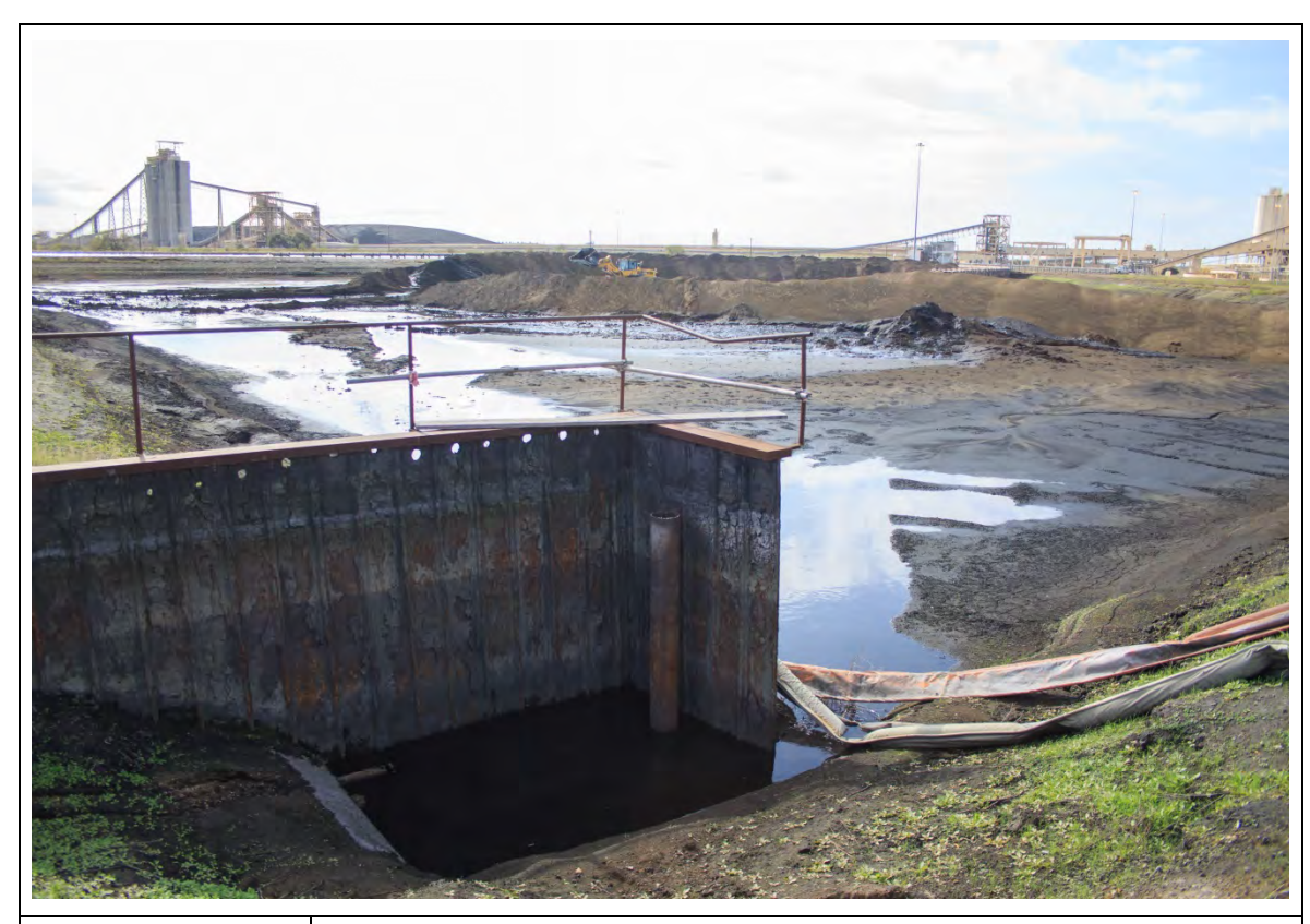
Photograph: 15 North Bottom Ash Pond – standing on northeast corner of pond – facing southwest. Outlet pipe in northeast corner of pond. Photo taken 12/16/15.