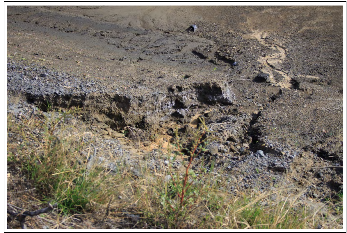
Photograph: 14 North Bottom Ash Pond – standing on western berm – facing east. Erosion features on inside of western berm. Photo taken 12/16/15.