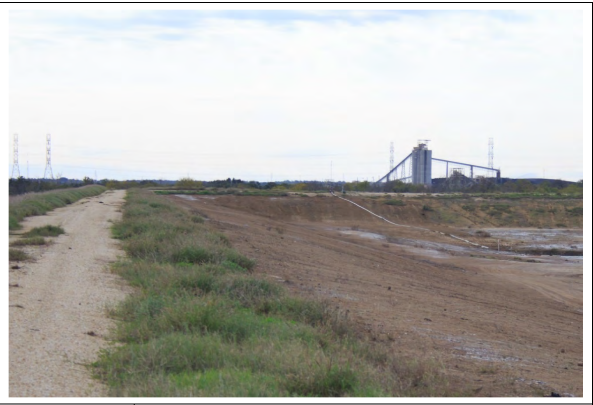
Photograph: 4 Fly Ash Landfill – standing on eastern berm - facing south. Photo taken 12/16/15.