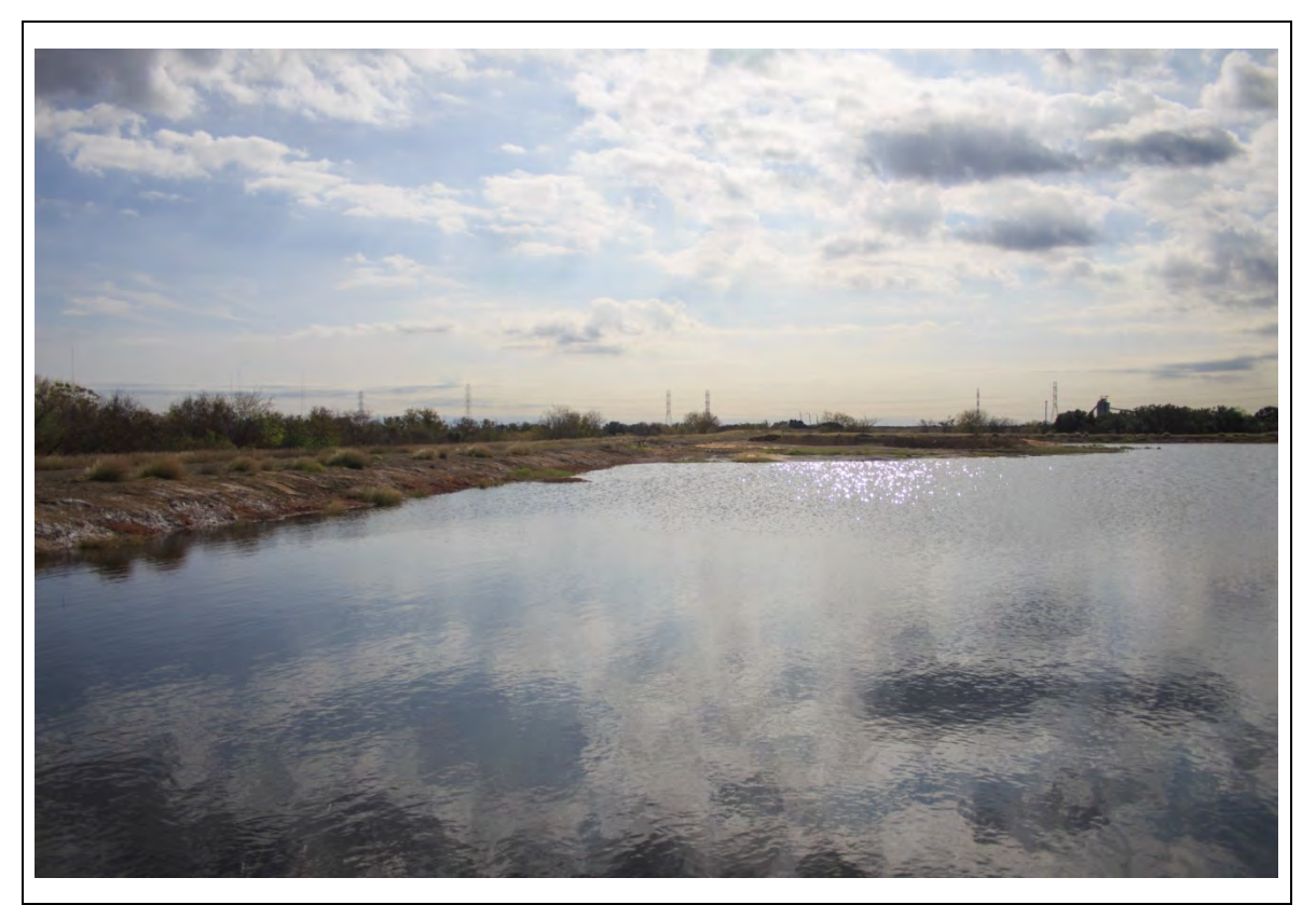
Photograph: 7 Evaporation Pond – standing on northern berm – facing southeast. Photo taken 12/16/15.