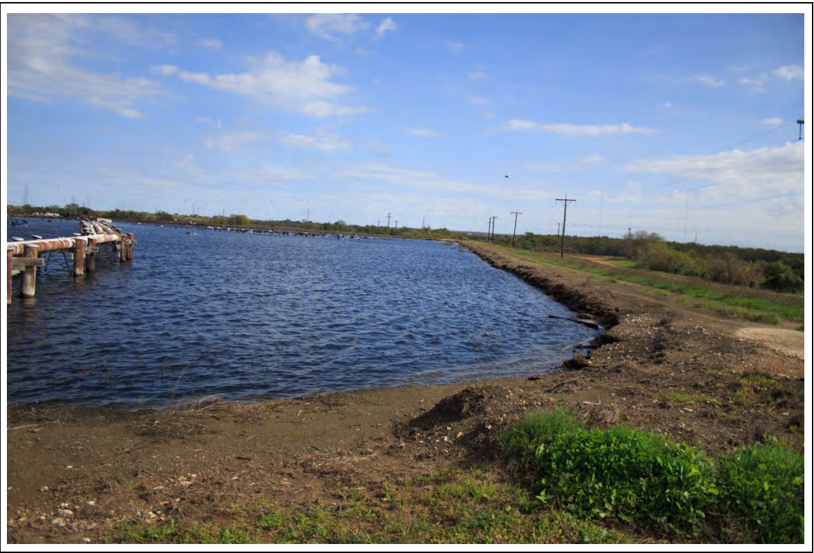
Photograph: 28 South Bottom Ash Pond – standing on southwest corner of pond – facing east. Photo taken 12/16/15.