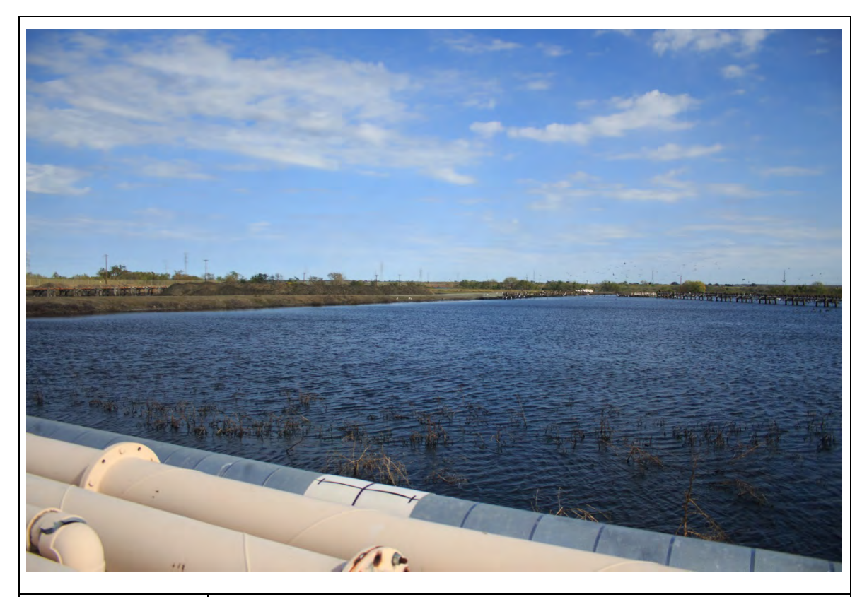
Photograph: 25 South Bottom Ash Pond – standing on western berm – facing northeast. Photo taken 12/16/15.