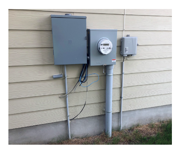
Underground Lines Connected to Electric Meter

CPS Energy is among the top public power wind energy buyers in the nation and San Antonio is #1 in Texas for solar energy capacity.