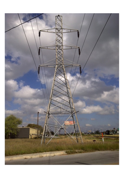
Existing Lattice Tower