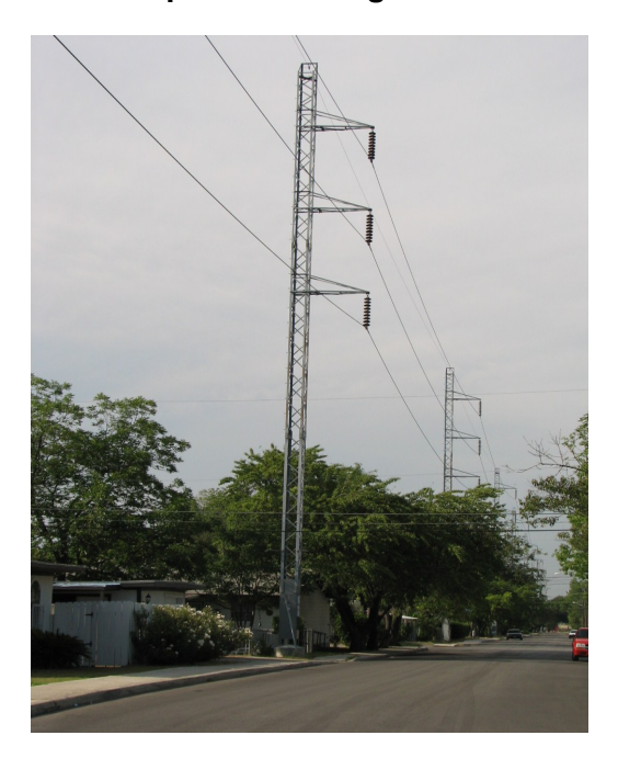
Example of New Structure