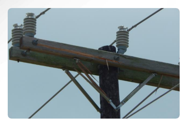
Lightning – damaged cross arm