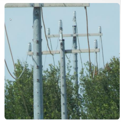
Trees touching lines