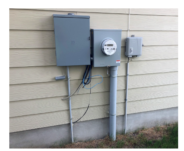
Underground Lines Connected to Electric Meter

CPS Energy is among the top public power wind energy buyers in the nation and San Antonio is #1 in Texas for solar energy capacity.