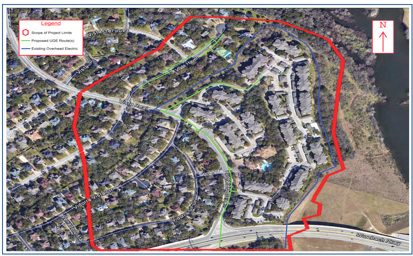
Conversion Area Map

Project information is available at cpsenergy.com/infrastructure.