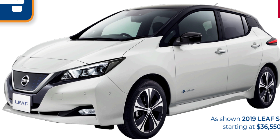
As shown 2019 LEAF S Plus starting at $36,550 1