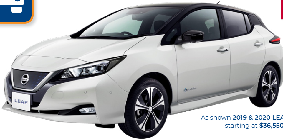
As shown 2019 & 2020 LEAF S Plus starting at $36,550 1