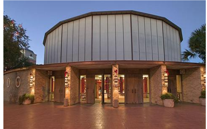
Villita Assembly Building 401 Villita St, San Antonio, Texas 78205