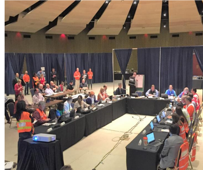
GridEx IV 2017

A functional exercise is conducted in a realistic, real-time environment; however, deployment of personnel and equipment is simulated .